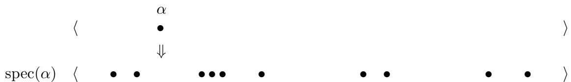
Figure A. Each real number \alpha determines \text{spec}(\alpha) , a countably infinite subset of the reals.